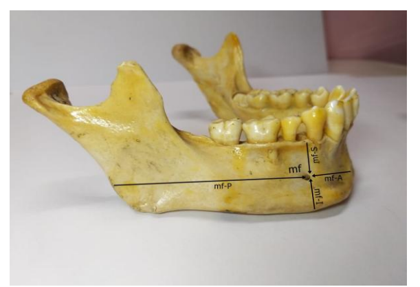
Figure 1. Photograph showing measurement of mental foramen (mf) from various mandibular landmarks, (a) Symphysis menti (mf-A) (b) Posterior border of mandibular ramus (mf-P) (c) mandibular alveolar margin (mf-S) and (d) Mandibular base (mf-I).

d) Distance between most anterior margin of mental foramen (mf) and inferior border of mandible: (mf-I).