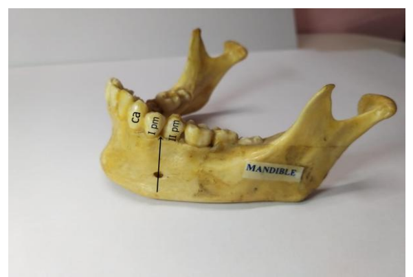
Figure 3. Left side of mandible showing mental foramen lying in position III.

Ca \rightarrow canine , I pm \rightarrow first premolar, II pm \rightarrow second premolar