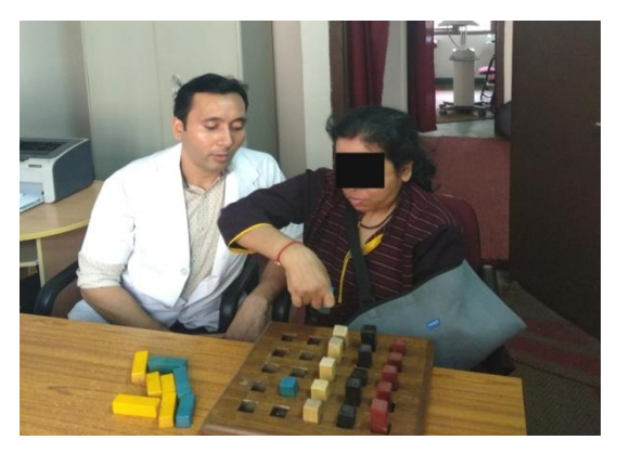
Fig. 1: Group A patient receiving forced used technique

Exercises and Active Exercises with, including Capsular stretching