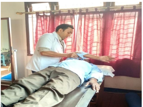
Fig. 2: Group B patient receiving Capsular stretching