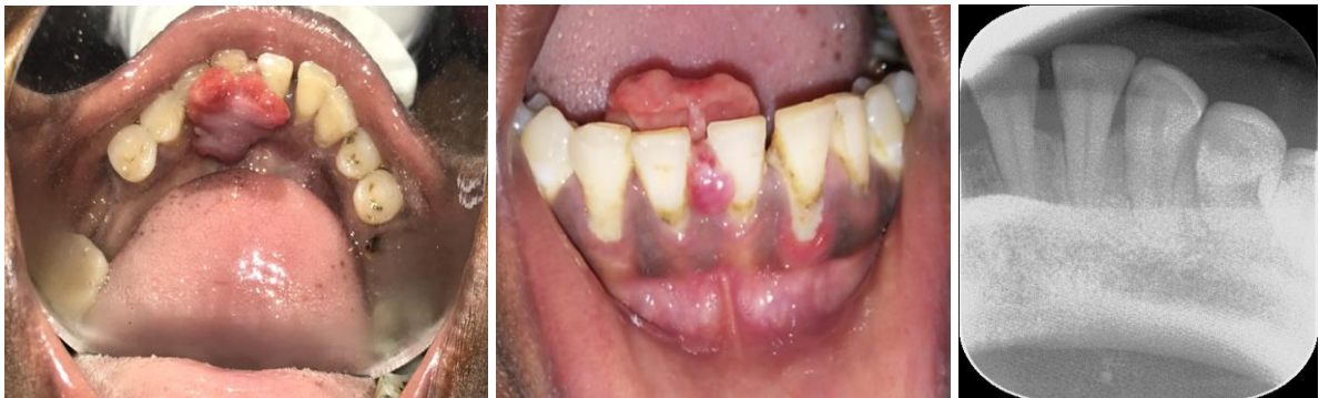
FIGURE 1: INTRAORAL VIEW OF THE LESION (LINGUAL) FIGURE 2: INTRAORAL VIEW OF THE LESION (BUCCAL) FIGURE 3: INTRA-OPERATIVE PERIAPICAL RADIOGRAPH OF THE LESION

no visible abnormalities were seen and the alveolar bone in the region of the growth appeared normal. Routine hemogram was found to be normal. A provisional diagnosis of pyogenic granuloma was made. Its differential diagnosis includes peripheral ossifying fibroma, peripheral giant cell granuloma, hemangioma and fibroma.