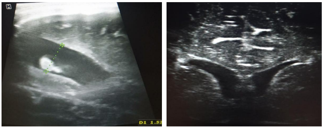
Figure 4: Through trans anterior fontanelle shows normal frontal horns; however at mastoid fontanelle approach shows focal dilatation of body of ventricles.