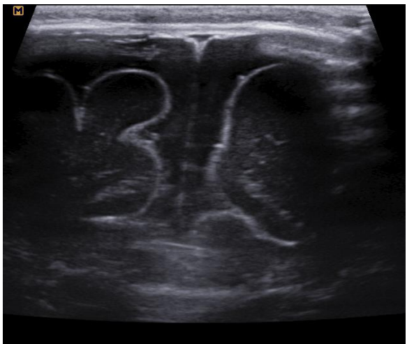
Figure 2: Sonography shows benign enlargement of subarachnoid space.