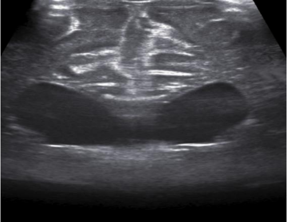
Figure 1: Trans anterior fontanelle sonography shows dilatation of both frontal lobes