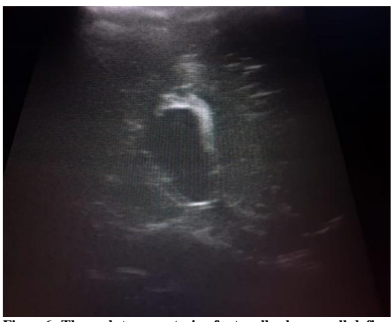
Figure6: Through trans anterior fontanelle shows well defined cystic lesion within choroid, suggestive of choroidal cyst.